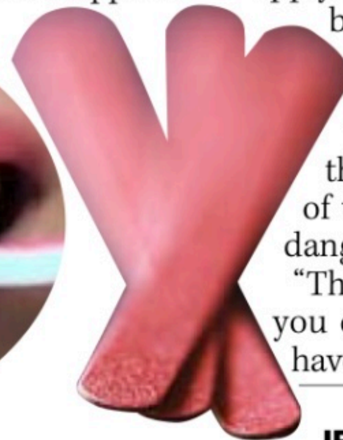
BITE & WRONG Nail files used on teeth

"teeth-whitening kits" are also a danger. She said: "In Ireland now we are only allowed to apply a certain level of bleach. It is 6% hydrogen peroxide or up to 16% carbamide peroxide.