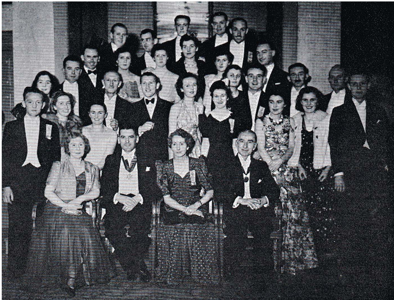
DENTAL STUDENTS SOCIETY DANCE, 1942