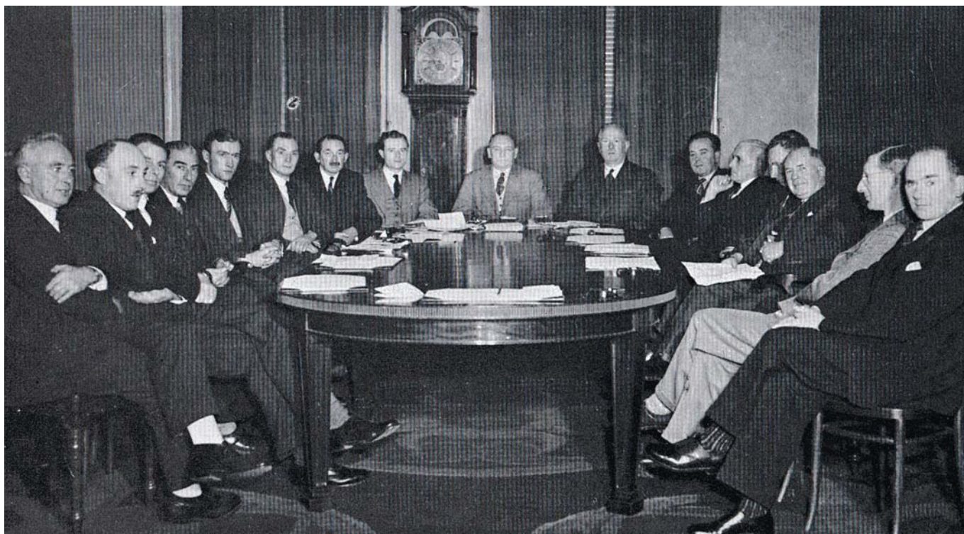
COUNCIL MEETING, 1952