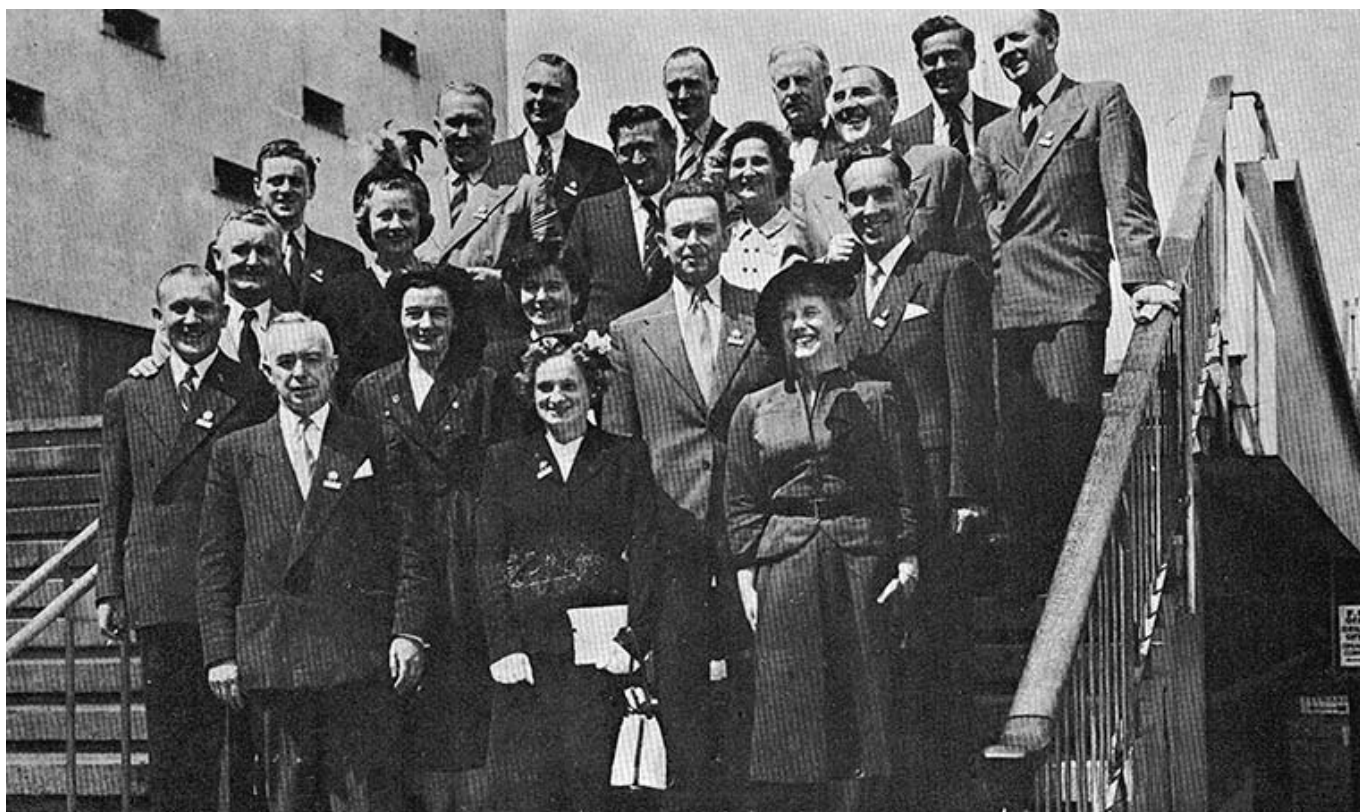
SOME OF THE IRISH PARTY ATTENDING THE FDI CONGRESS, LONDON, 1952