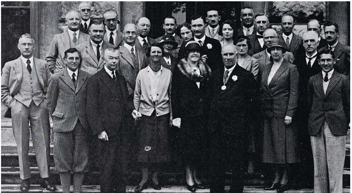
IRISH DENTAL ASSOCIATION AGM, GALWAY, 1933