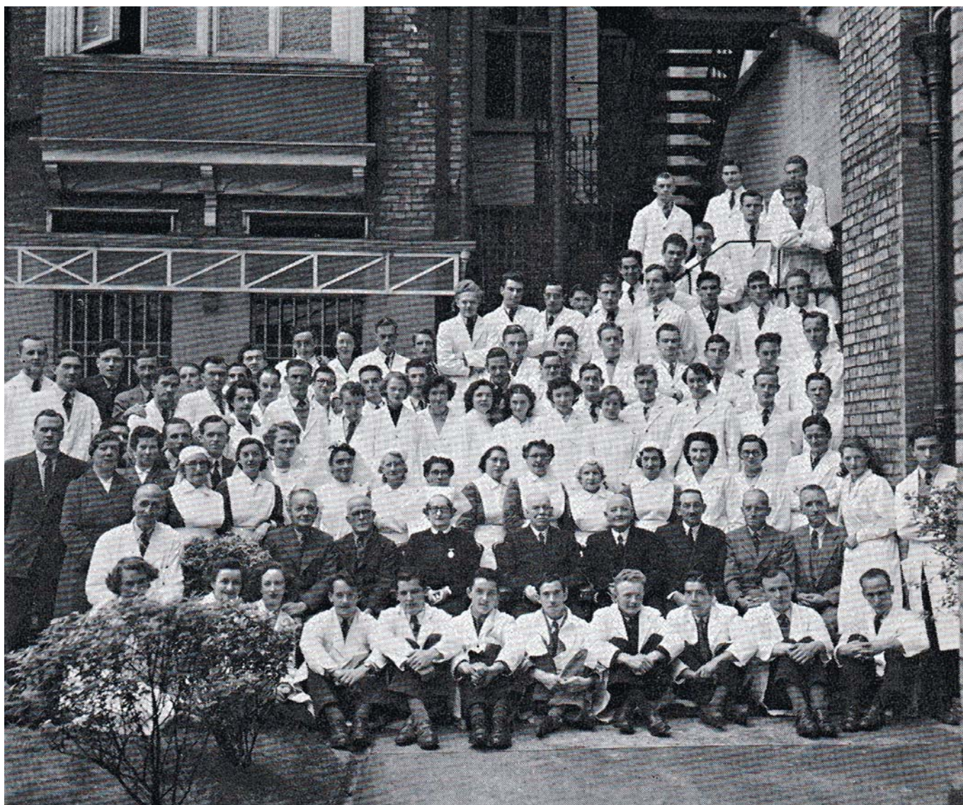
DENTAL HOSPITAL STAFF AND STUDENTS, 1950