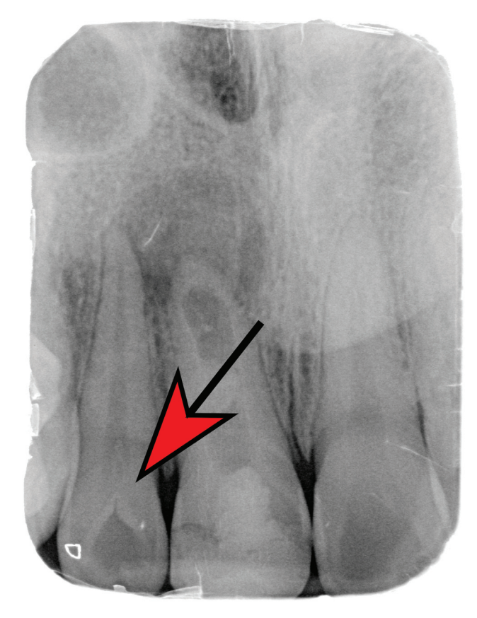
FIGURE 1: Teeth with dens invaginatus may present as asymptomatic, with little external deformity, but may become apparent on radiographs as incidental findings.

association with other dental anomalies such as gemination, microdontia, hypodontia, taurodontism, dentinogenesis imperfecta and mesiodens.<sup>1,2</sup>