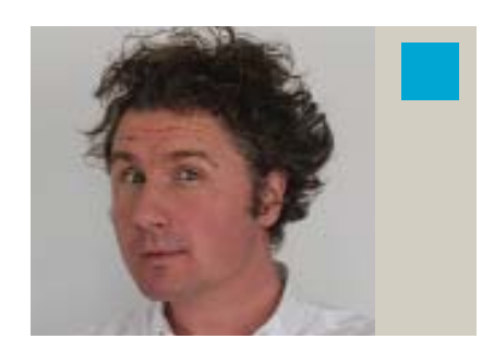
BEN GOLDACRE Medical physician, author and columnist

Trauma to the face, head and teeth is common in sport. Dental trauma may be a harbinger for underlying trauma. We discuss mandibular fracture, gum shield use, headgear use and concussion in sports such as rugby, boxing and cycling.