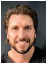
Prof. Adam Nulty

Currently, we know that approximately one million people in Ireland suffer from diabetes, asthma, chronic obstructive pulmonary disease (COPD) or cardiovascular disease, while there are close to 200,000 cancer survivors. These numbers are expected to rise exponentially in the next couple of decades. A number of systemic conditions can effect oral health. Sometimes this impact is due to an oral manifestation of the disease, for others it may be an oral adverse effect of the treatments employed to manage the systemic disease, and for some the impact may be due to physical inability to maintain appropriate oral hygiene. The provision of dental care or the maintenance of good oral health is paramount in these patients and therefore the role of the dental team cannot be overlooked. The objective of this lecture is to provide an overview of common chronic conditions in an Irish population, highlighting the oral implications of these chronic conditions and the impact of treatments used on the oral cavity.