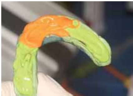
FIGURE 17: The tray is returned to the mouth and boarder moulded many times until the PVS is fully set.