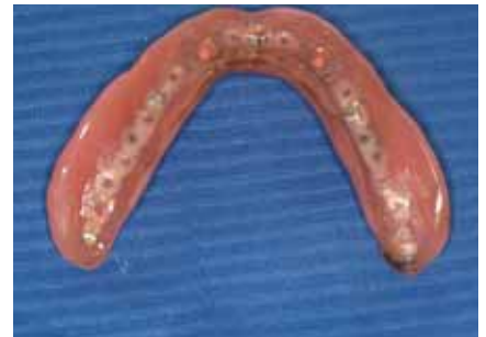
FIGURE 19: The final denture.

STEP 6 A composite curing light will rapidly set the tray material. The tray will not stick to the cast once set. The pencil mark will transfer to the set tray material and the tray can be trimmed to ensure the borders are not overextended. The final tray should be left unpolished to help retain impression material. Perforations are not placed in the tray. The tray should be disinfected (Figure 11).