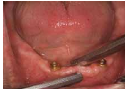
FIGURE 2: The mobility of the tissues is tested and mobile areas noted. Here the anterior region is mobile.