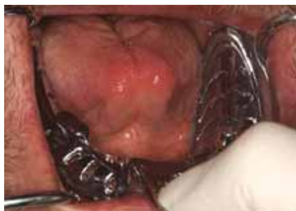
FIGURE 3: A stock edentulous tray is sized.