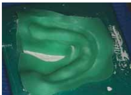
FIGURE 9: The tray material is rapidly adapted to the cast and trimmed.