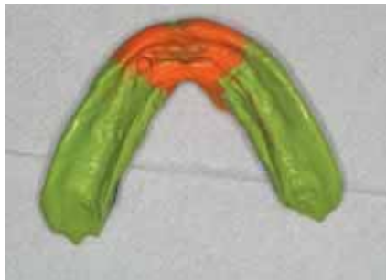
FIGURE 18: The final impression.