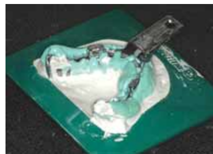
FIGURE 7: The impression is cast in plaster and set in a base former.