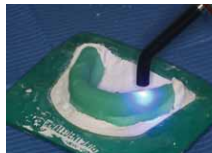
FIGURE 10: A curing light is used to polymerise the material. Note the shape of the handle so as not to interfere with moulding movements intraorally.

Below is a step-by-step method for building up of an accurate, functionally extended mandibular impression. This technique also works equally well for maxillary impressions and impressions for partial dentures. This technique is similar to that published by Massad, 5 however the "Massad technique" utilises prefabricated stock trays. It is this author's opinion that using rapidly fabricated custom trays gives the dentist greater control, less use of impression material, and leads to less overextension and less distortion of the dimensions of the sulcus. No particular brand of impression material is advocated, so long as various viscosities are used. All PVS materials will bond to each other when dry.