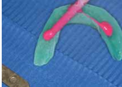
FIGURE 12: Occlusal registration silicone used to space the tray.