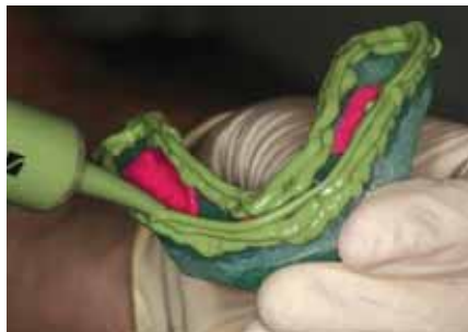
FIGURE 14: Heavy viscosity PVS is syringed around the adhered borders.