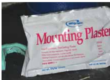
FIGURE 6: Mounting plaster is fast setting and suitable for edentulous impression.