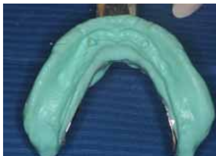
FIGURE 4: A good but overextended primary impression.