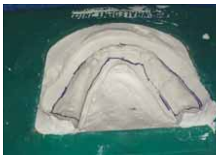
FIGURE 8: Once set, the cast is marked for proper tray extension.