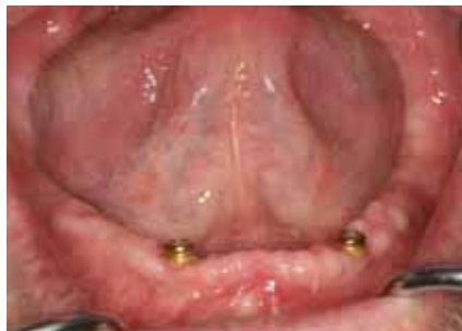
FIGURE 1: The uncompressed ridges. Implants are present in this case, however the technique is identical for conventional complete dentures.