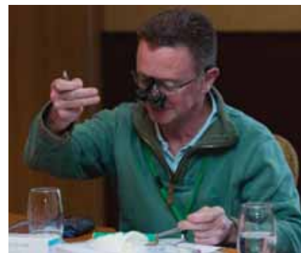
You had to be there 124

Step-by-step denture construction technique