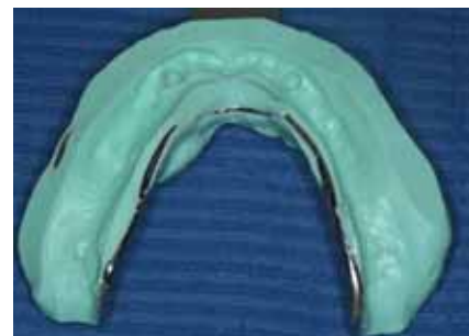
FIGURE 5: The boarders are removed from the impression to ensure the custom tray will be short of the borders.