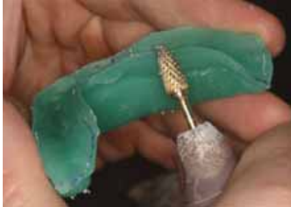
FIGURE 11: The tray is trimmed and smoothed.