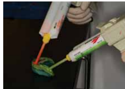
FIGURE 16: Ultralight PVS used in the mobile regions and light bodies in the immobile regions. Two guns are required to express the material rapidly enough to avoid premature setting.