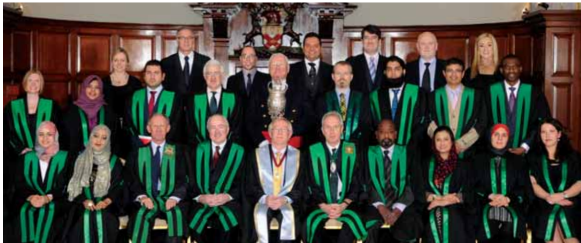
Dental graduates at winter conferring RCSI, including representatives of Faculty of Dentistry RCSI, Irish Dental Association, and Irish Faculty of Primary Dental Care.