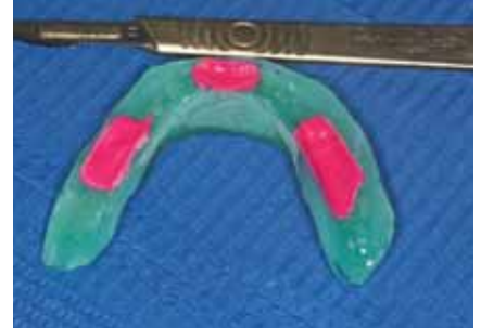
FIGURE 13: Spacers are trimmed away from borders.