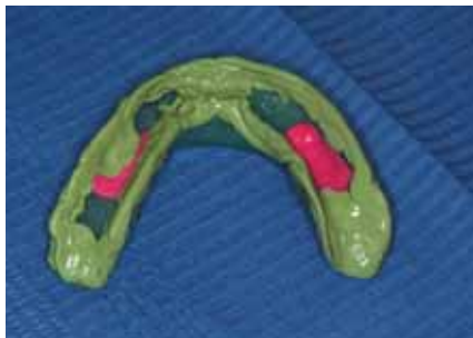
FIGURE 15: Borders moulded intraorally.