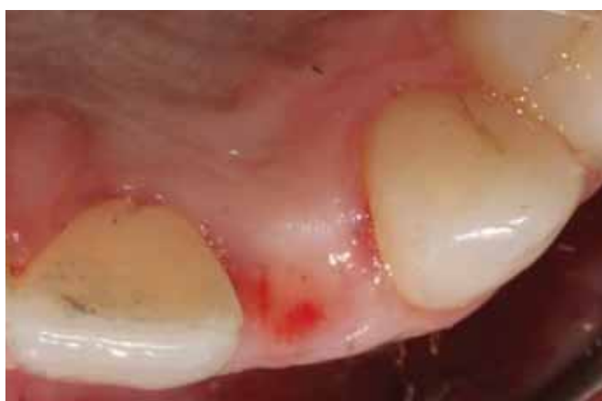
FIGURE 4: Ideal alignment of abutment teeth.