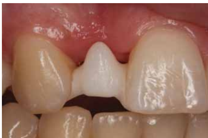
FIGURE 10: Zirconium RBFDP framework try in (picture courtesy of Dr M O'Sullivan).