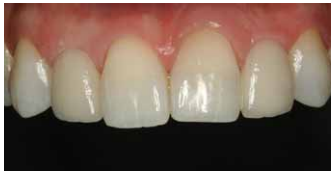
FIGURE 5: Two anterior three-unit RBFDPs in situ (from facial aspect).