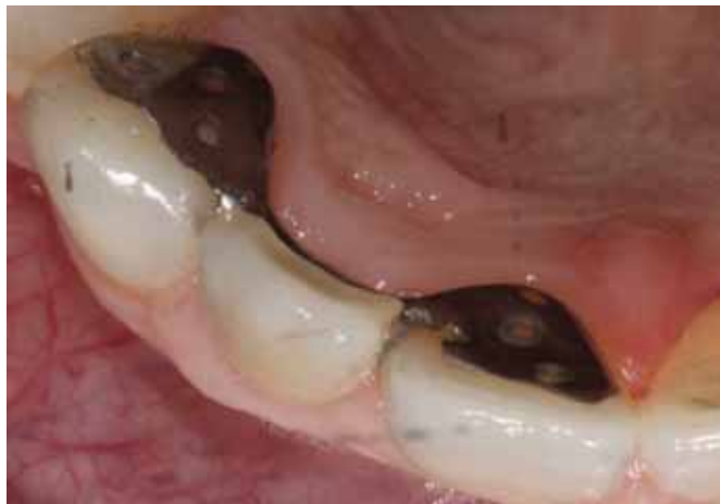
FIGURE 1: RBFDP using Rochette design with perforated retainers.

Rochette in 1973 2 introduced the concept of bonding a metal retainer to enamel using adhesive resin. His application was to splint periodontally involved mandibular anterior teeth using a cast gold bar bonded to the lingual surfaces of the teeth. The cast metal splint described had perforations to provide mechanical interlocking between the cement and the metal. His introductory article made reference to modifying the technique for application as an RBFDP. Today, this type of design with perforated retainers, as depicted in Figure 1, can be used to facilitate retrievability when an RBFDP is used as a provisional restoration.