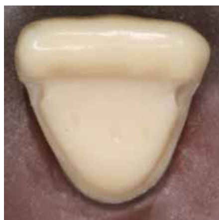
FIGURE 6: Suggested preparation for anterior RBFDP.

“Retention prevents the removal of the restoration along the path of insertion or the long axis of the tooth preparation. Resistance prevents dislodgement of the restoration by forces directed in an apical or oblique direction and prevents any movement of the restoration under occlusal forces”. Resistance form can be evaluated prior to cementation of the restoration. It optimises dissipation of forces and minimises dependence on the resin bond. 7 Tooth preparation aims to create a definite outline form and path of insertion for the restoration, therefore optimising resistance and retention forms while minimising metal display or show through. Tooth reduction is conservative (remaining in enamel) for RBFDP preparation. This is one of numerous