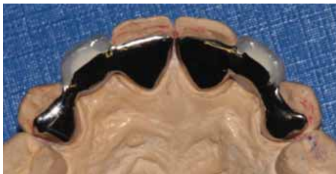
FIGURE 3: Two anterior three-unit RBFDPs placed following orthodontic treatment.