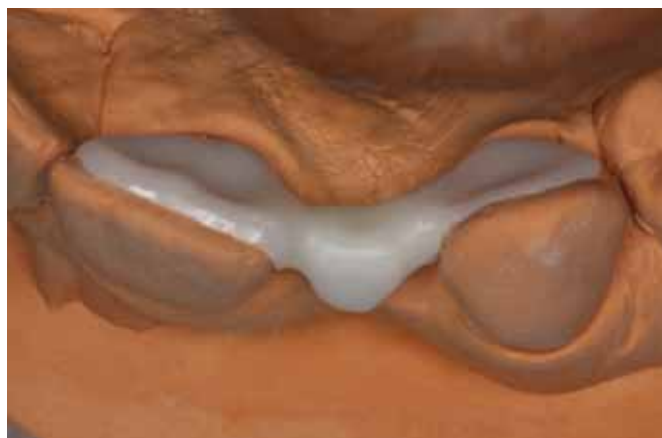
FIGURE 11: Zirconium RBFDP framework from occlusal perspective.

This is due to the greater bond strengths observed with base metals, as well as the strength of these metals in thin section. Retainers of cobalt chromium alloy should ideally be a minimum of 0.5mm thick. 8 Ibrahim et al. 8 found in vitro that increasing metal retainer thickness necessitated increasing force to dislodge the retainer. The authors concluded that using alloys with a high modulus of elasticity is