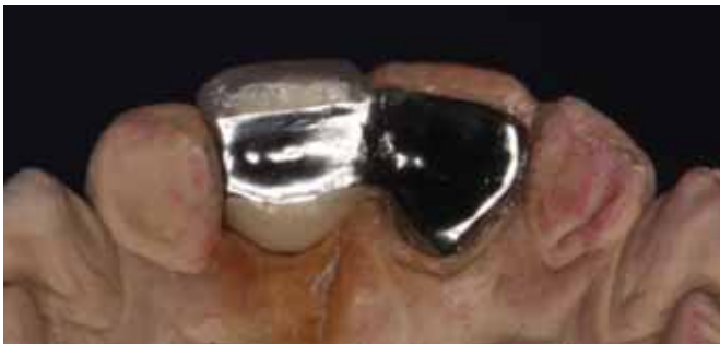
FIGURE 8: Single abutment, single pontic cantilevered RBFPD.

preparation is illustrated in Figure 6. Saad et al. 9 in an in vitro study, found that a 30.8% increase in shearing force was required to dislodge the retainer after the addition of proximal grooves. A rest seat in the cingulum area resists tissueward movement of the casting, which aids correct seating of the restoration during cementation. This should be prepared with a flat-ended, tapered diamond bur. This part of the preparation should also remain in enamel. Sometimes incisal rests are incorporated to aid correct seating of the casting. They should not be surface treated to facilitate ease of removal after cementation.