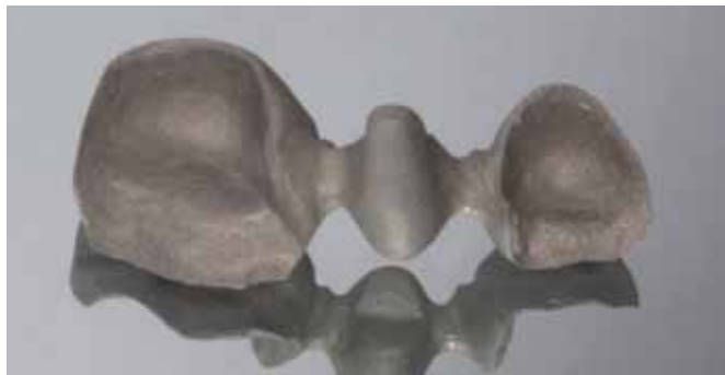
FIGURE 9: Base metal framework prior to porcelain application.