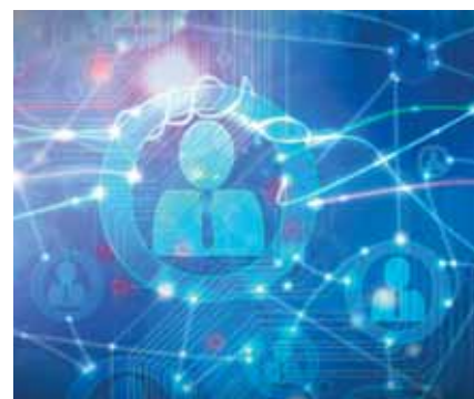
Practice management 322

We speak to the man who hears the dental complaints.