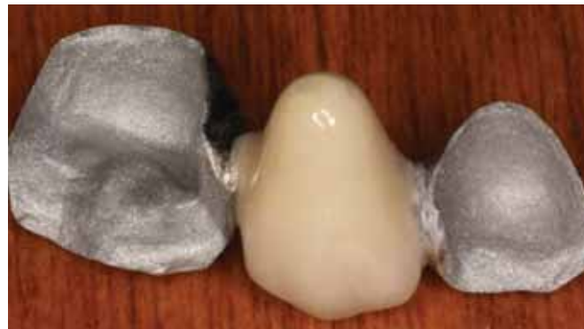
FIGURE 2: Airborne particle abrasion of the fitting surface with 50µ aluminium oxide particles.

Attention then turned to treatment of the retainer's fitting surface to increase the resin to metal bond strength. Livaditis and Thompson 5 introduced the concept of electrolytically etching a non-precious metal to microscopically roughen the metal surface. Electrolytic etching works on the principle of selective dissolution of the most corrosion-sensitive phases of the metal. Mean tensile bond strengths of 27.3MPa for resin composite bonded to an electrolytically etched