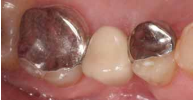
FIGURE 7: Cemented three-unit RBFPD.